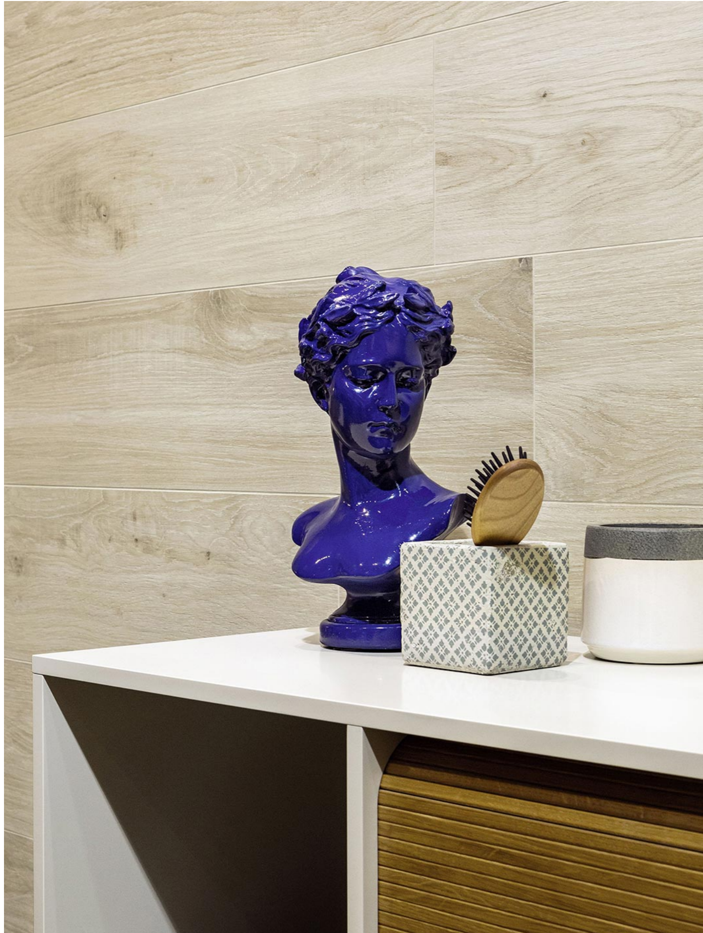
M05E Treverkmost White Rt 25x150cm