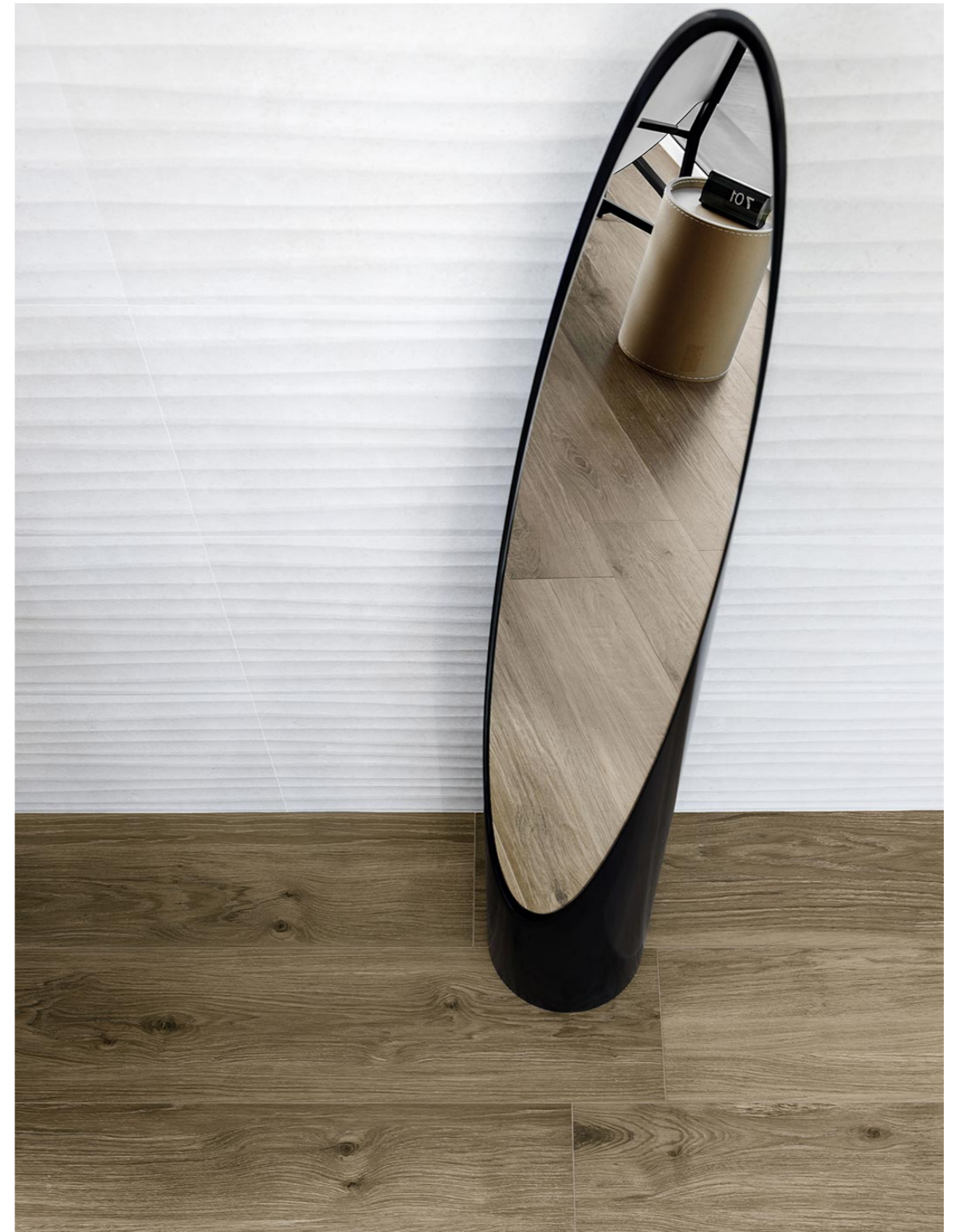
M05G Treverkmost Brown Rt 25x150cm