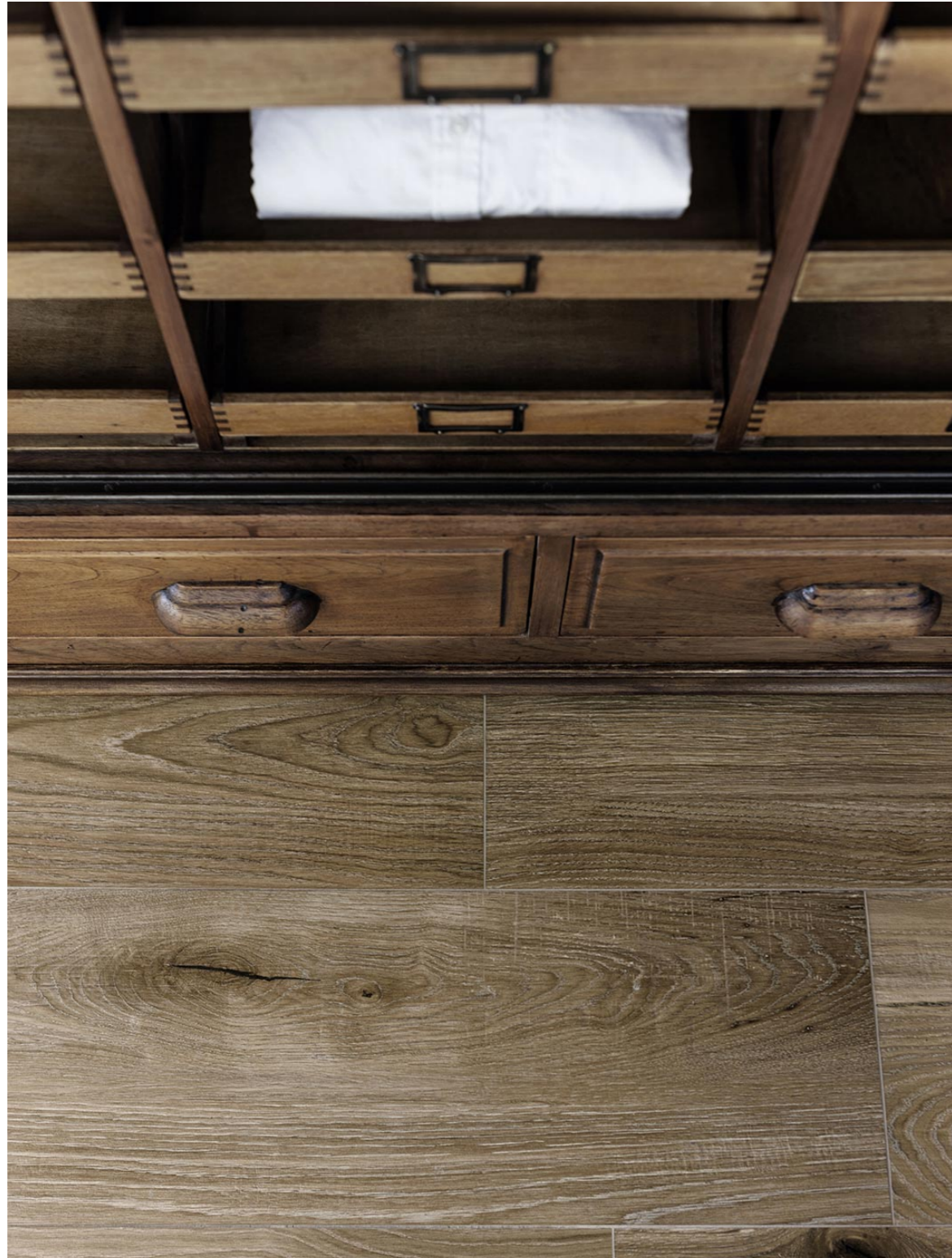
M05G Treverkmost Brown Rt 25x150cm