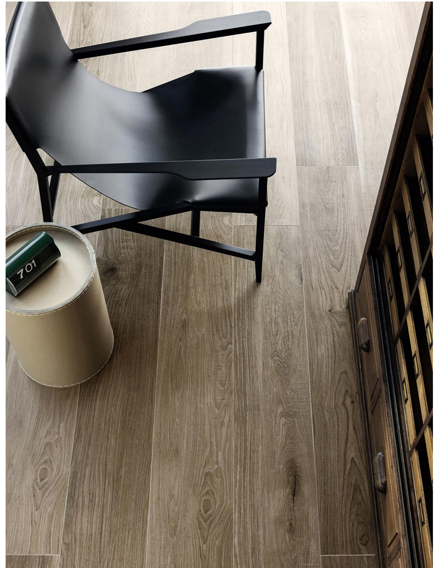
M05G Treverkmost Brown Rt 25x150cm