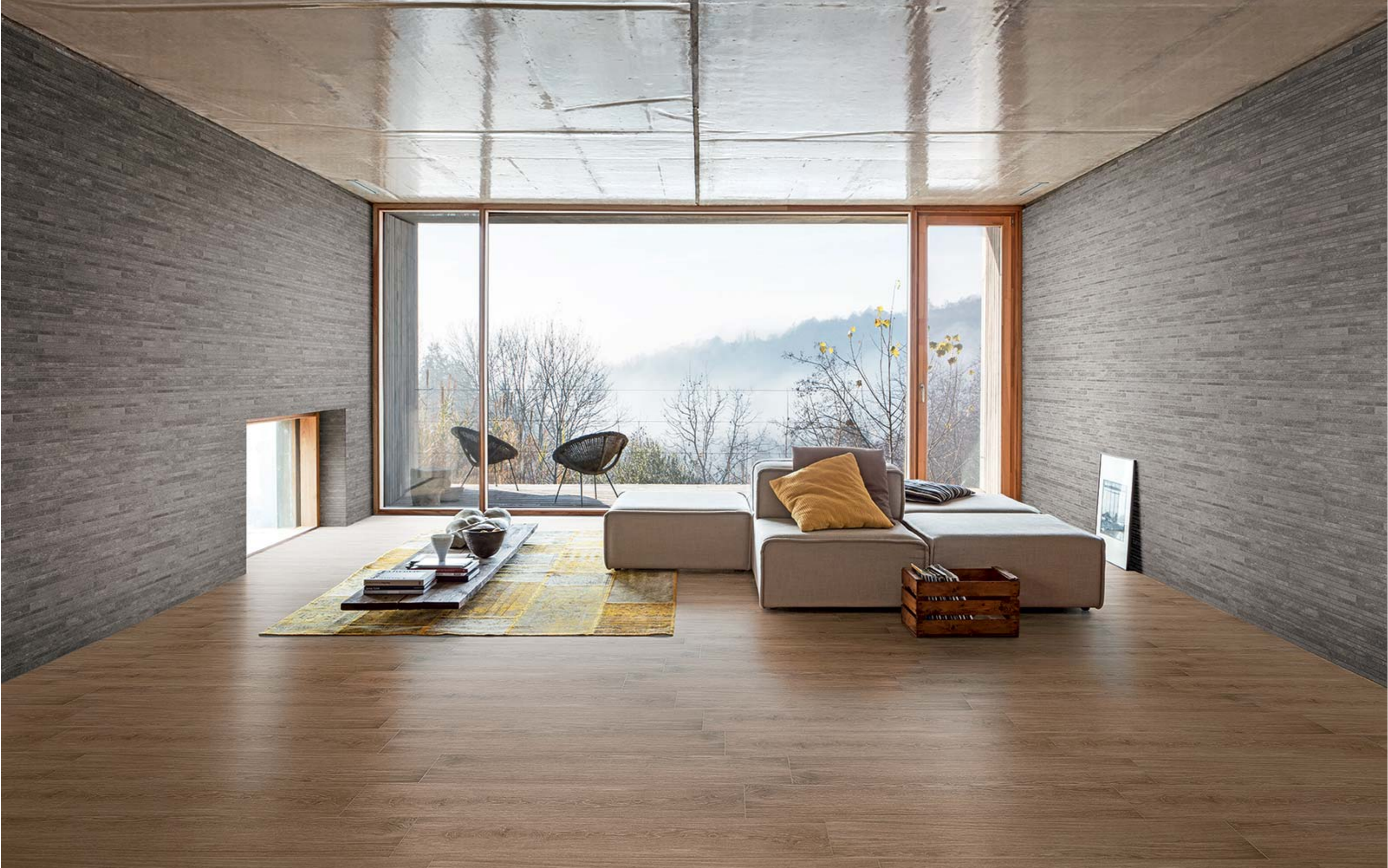
M05L Treverkmost Brown Selection Rt 25x150cm M056 Ardesia Cenere Rt 30x60cm