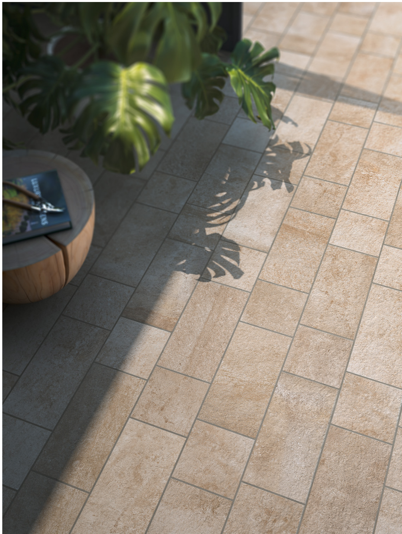
MH7C Pietra Occitana Beige 20x40cm MH77 Pietra Occitana Beige 20x20cm