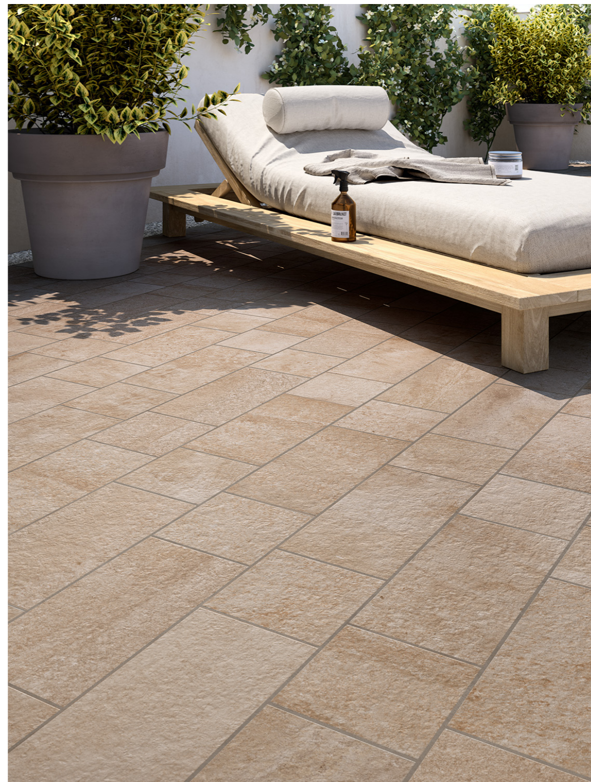
MH7C Pietra Occitana Beige 20x40cm MH77 Pietra Occitana Beige 20x20cm